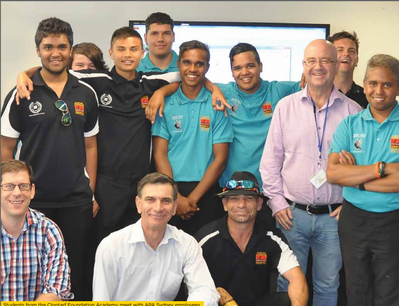
Students from the Clontarf Foundation Academy meet with APA Sydney employees